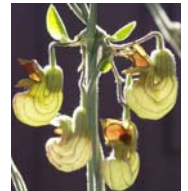
Dutchman's Pipe Aristolochia californica

1. Planting Smart Plants: The foundation of a Smart Gardening landscape is planting local native plants – to restore natural balance. A seasonal succession of native plant flowers, berries and fruit is best for our native birds, bees, butterflies, and other beneficial insects.