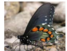
Pipevine Swallowtail Battus philenor

5. Build habitat: Providing water, shelter, and food sources for wildlife can make an important difference! A Smart Garden even lets leaves do the fertilizing, feeding everything from birds to micro-organisms... and saves you time!